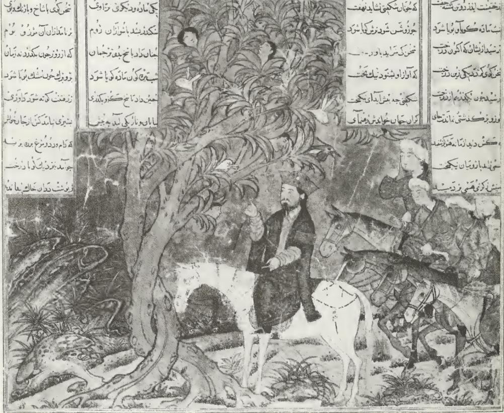
Iskandar (Alexander the Great) at the Talking Tree, from a copy of the Shanama by Firdawsi (d. 1020). Iran, Tabriz, ca. 1335–40; ink, opaque watercolor, and gold on paper. 40.8 x 30.1 cm, Freer Gallery of Art, Smithsonian Institution, Purchase F1935.23